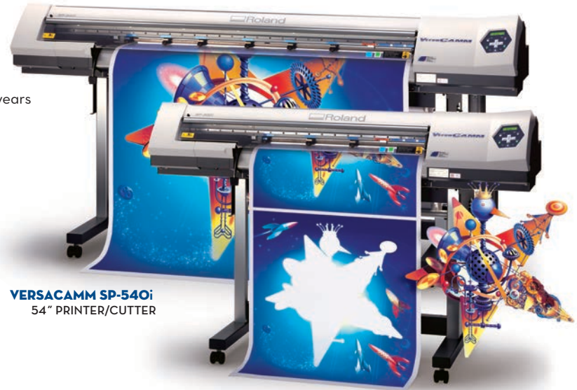
VERSACAMM SP-540i 54" PRINTER/CUTTER