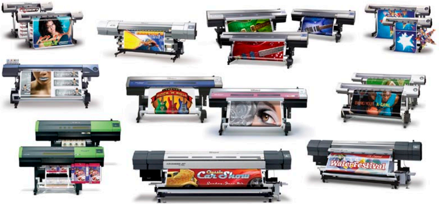
Roland's award-winning inkjet line-up featured above (left to right): Top row: VersaCAMM VP-i Series printer/cutters; Hi-Fi Express FP-740 sublimation printer; SOLJET Pro III XJ Series printers; VersaCAMM SP-i Series printer/cutters. Middle row: VersaCAMM VS-640 printer/cutter; SoLJET Pro III XC-540 and XC-540MT printer/cutters; VersaArt RS Series printers. Bottom row: VersaUV LEC Series UV printer/cutters; AdvancedJET AJ-1000i grand format printer; AdvancedJET AJ-740 printer.

For more information including testimonials by Roland ink users, please visit our web site at www.rolanddga.com/ink .