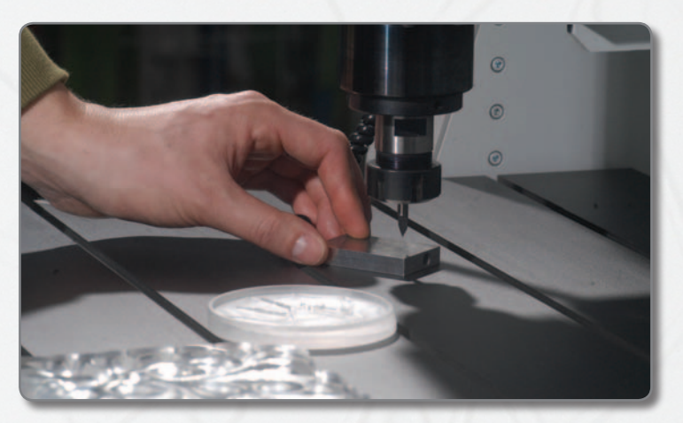
Standard equipment: Professional software Delcam ArtCAM Express Aluminium T-slot work table Automatic Z axis sensor Emergency STOP buttons

Professional software Delcam ArtCAM Insignia Professional software Delcam ArtCAM PRO Spray cooling system High-pressure vane vacuum pump and vacuum table Slot for dust collector Industrial dust collector 3D contact scanner 3D laser scanner Oscillating tangential knife Combi-head: oscillating knife + creasing wheel Combi-head: oscillating knife + tangential knife for vinyl sheet cutting Camera system for print marks